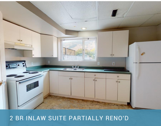
2 BR INLAW SUITE PARTIALLY RENO'D