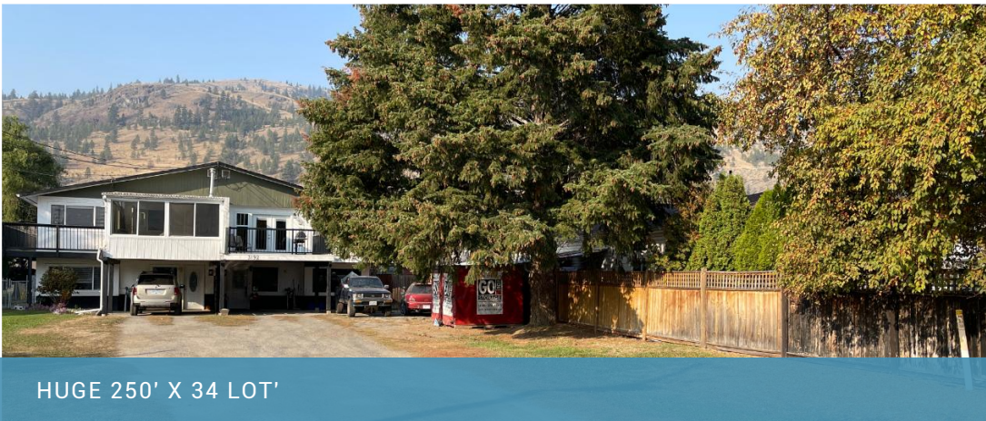
HUGE 250' X 34 LOT'

2 bedroom with suite potential in this Westsyde updated 5 bedroom half duplex. Mainfloor has had recent kitchen with new millwork. Grand island with eating area, stone counters, under mount sink, soft closers on drawers and cupboards. Open kitchen dining and living room. French doors to large deck with aluminum railings. Main bath has recent tub and surround, vanity and fixtures. 3 good sized bedrooms on the main floor. Lower level has former suite with Reno under way (buyer to complete). All partition walls in place, kitchen, bathroom (needs a new tub and shower setup framed in though). Large living room down with recent new entrance door to back yard. Laundry setup is under stairs off foyer. House is out of ground so very bright on both levels. Sideyard has access to upper deck and could be a dog run for fido (fenced). Backyard area is also fully fenced. Garden shed. Gas easement in front yard has resulted in a huge lot of approx 250 x 34 feet with lots of room for an RV. Close to schools, shopping, golf and transportation.