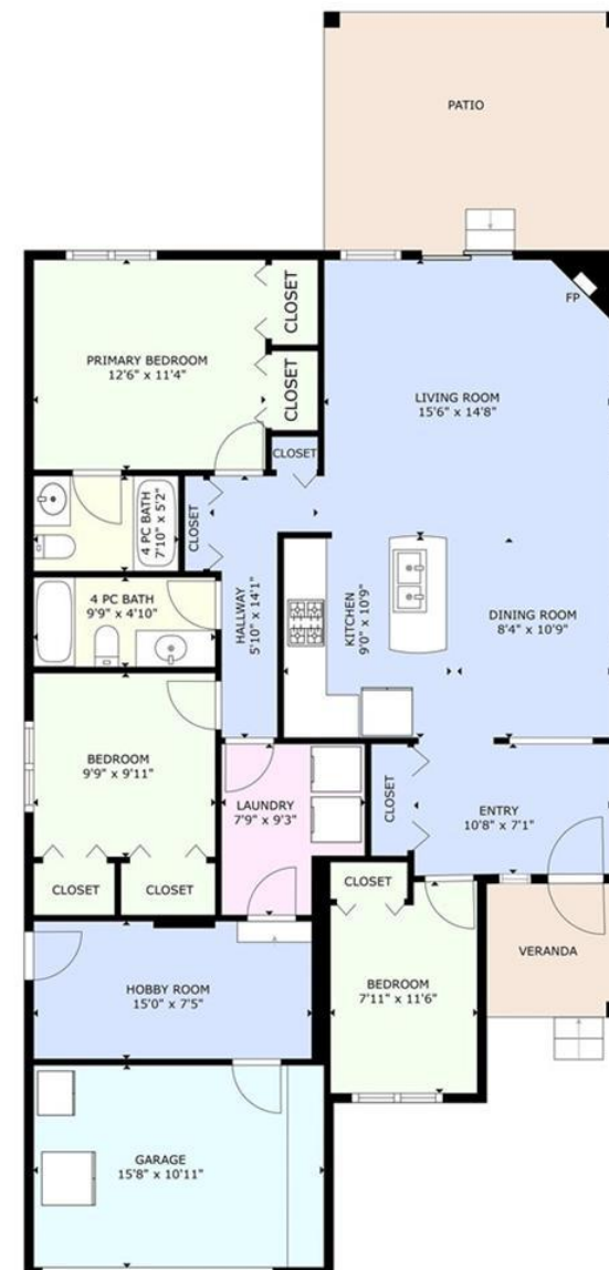
FLOOR PLAN GROSS INTERNAL AREA FLOOR PLAN: 1,349 sq. ft EXCLUDED AREA: GARAGE: 171 sq. ft SIZES AND DIMENSIONS ARE APPROXIMATE. ACTUAL MAY VARY.

Welcome to this charming rancher nestled in the desirable community of Shawnigan Station. Built in 2011, this well maintained home offers a perfect blend of comfort and modern convenience. Upon entry, you are greeted by an inviting open concept design that seamlessly connects the living, dining, and kitchen areas. The home boasts a natural gas fireplace, furnace, and oven, ensuring both comfort and efficiency. Outside, enjoy a beautifully manicured yard enhanced with an irrigation system. The outdoor space features a variety of flora including Japanese maple, blueberry and raspberry bushes, rose bushes, a cherry blossom tree, and fragrant lavender. Negotiable amenities include a hot tub, green house, and EV charger, catering to modern lifestyles and preferences. Conveniently located with a school bus stop at the end of the street, this home combines tranquility with accessibility, making it ideal for families seeking both comfort and practicality.