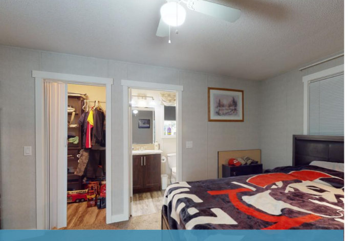
Master has 4 piece ensuite plus large walkin