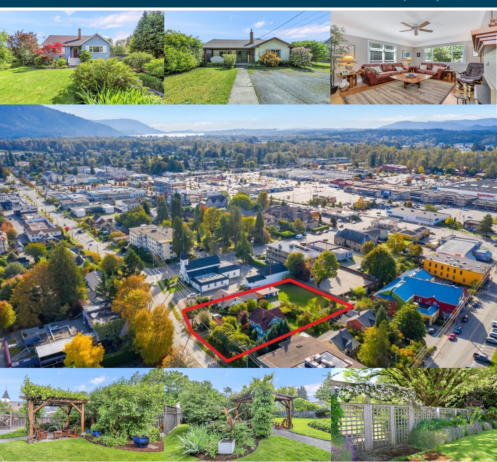
40 & 50 Coronation Ave