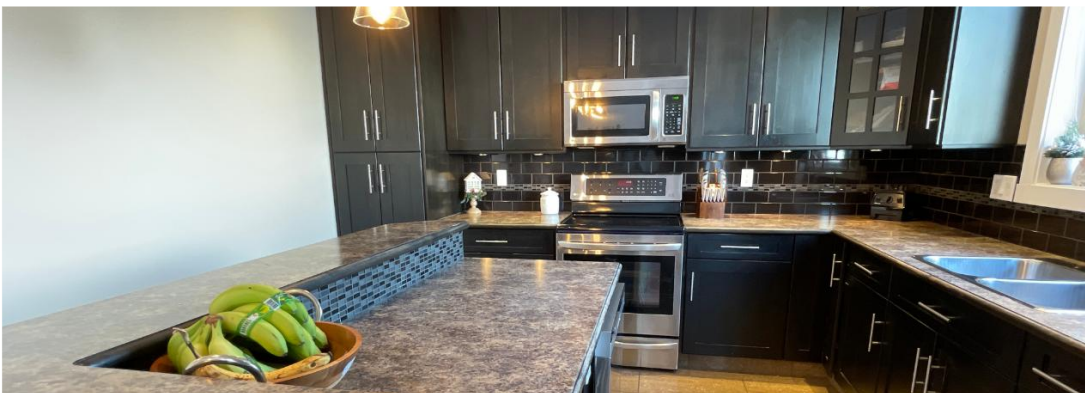
LARGE ISLAND KITCHEN WITH STAINLESS STEEL APPLIANCES

Beautifully crafted home in family orientated Campbell Creek. 3+2 bedrooms, this home is perfect for a growing family with in-law potential downstairs. The main floor has an open concept living room with 15' vaulted ceiling and large transom windows which leads into the dining room and island kitchen. French doors from dining room to 32' x 10' deck with mountain views. Main floor laundry plus a huge double garage. The Master bedroom has French doors onto the deck, a 4 piece ensuite and huge walk-in closet. Lower level has two bedrooms, family room, theatre room, and hobby nook, plus 4 piece bathroom. Lower level could easily be suited, it has two separate entrances and roughed in plumbing for a future suite kitchen. Two entrances into lower level. Side access via stairs to the lower foyer as showing in photos. Includes all appliances and Hot Tub. Large 8400 sq ft lot fully fenced backyard with raised garden bed. 200 amp service in garage and 100 amp sub panel on lower level. HE Furnace. Central AC. BONUS: Huge RV pad on the east side of the home. Close to golf and recreation and shopping. Just minutes to downtown Kamloops.