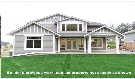
Builder's previous work, subject property not exactly as shown