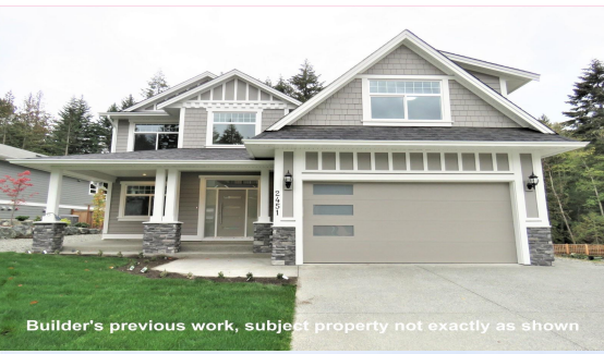
Builder's previous work, subject property not exactly as shown