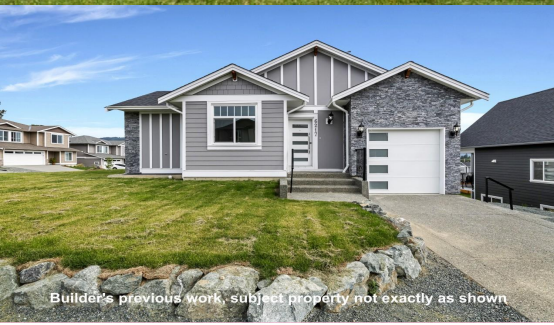
Builder's previous work, subject property not exactly as shown