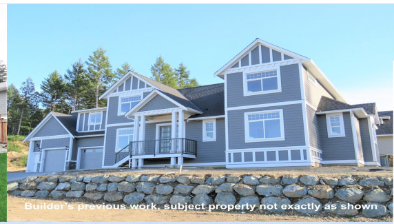
Builder's previous work, subject property not exactly as shown