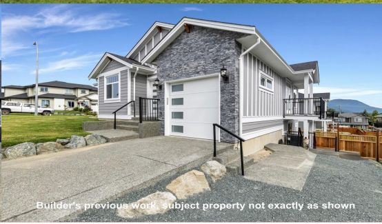
Builder's previous work, subject property not exactly as shown