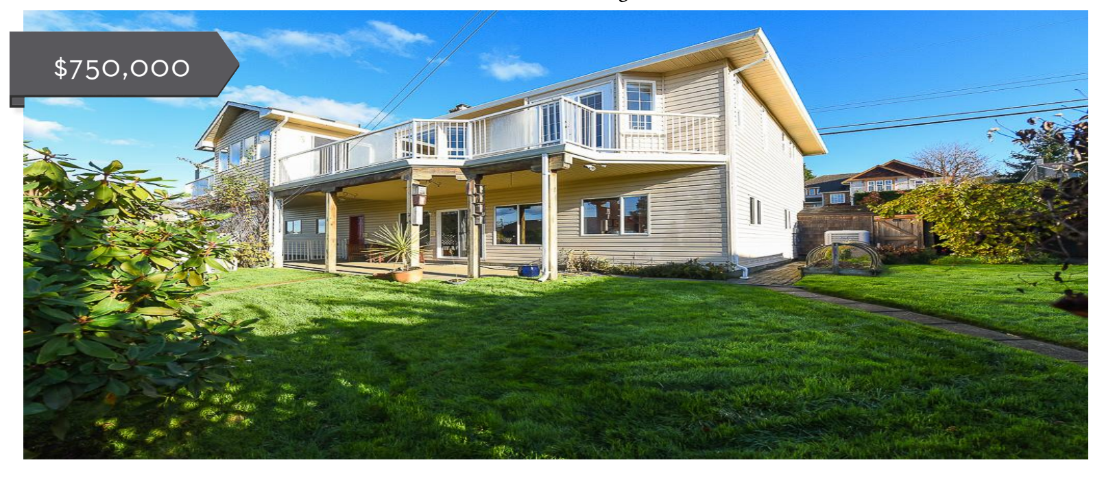
BEDROOMS:4 BATH:3 SQUARE FOOTAGE:2674 LOT ACRES:.205 LOCATION:Courtenay