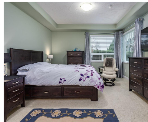
511-3666 Royal Vista Way, Courtenay, BC