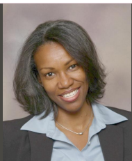
Janet Herron* REALTY EXECUTIVES VANTAGE

To view interactive floor plans scan this QR code with your smart phone