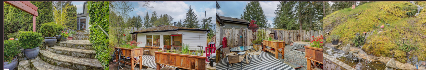
JP Tait Pemberton Holmes - Oak Bay