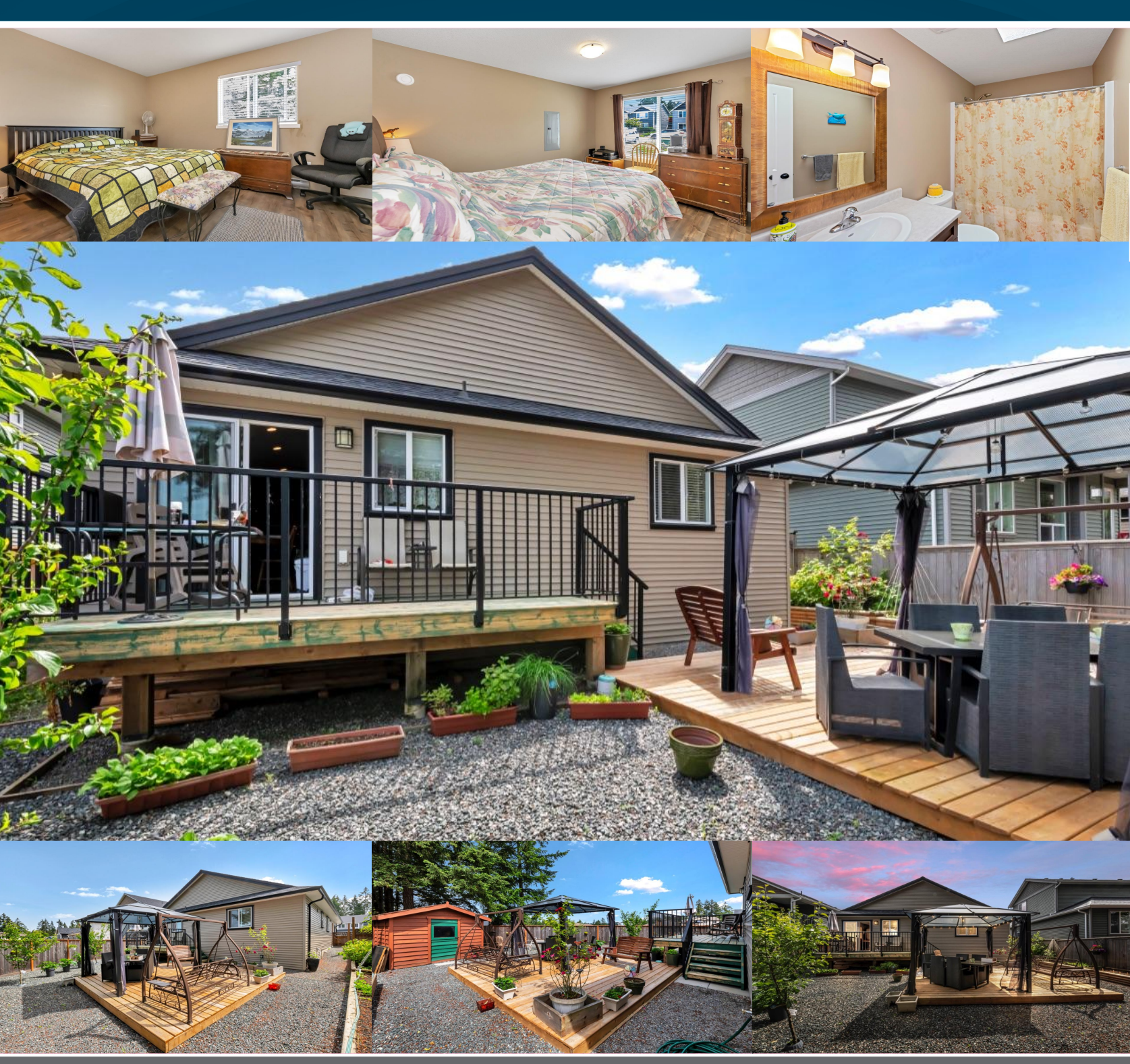
2183 Village Drive