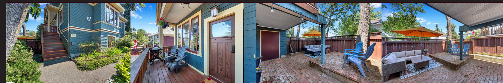
Kash Burley Pemberton Holmes - Oak Bay