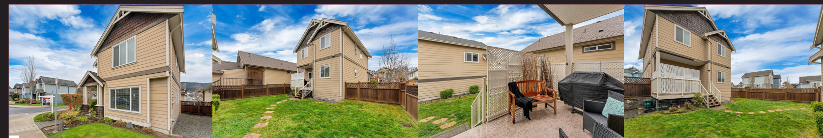
Kash Burley Pemberton Holmes - Oak Bay