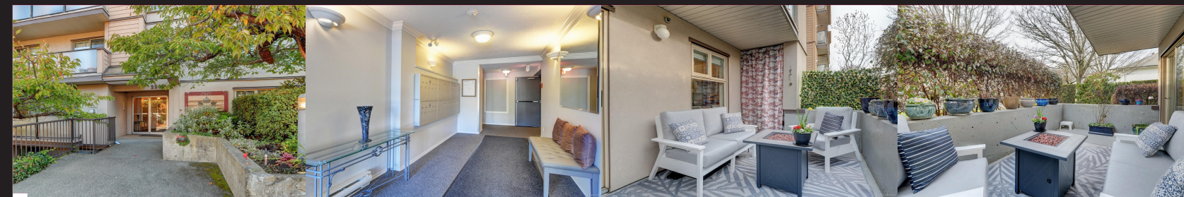
JP Tait Pemberton Holmes - Oak Bay