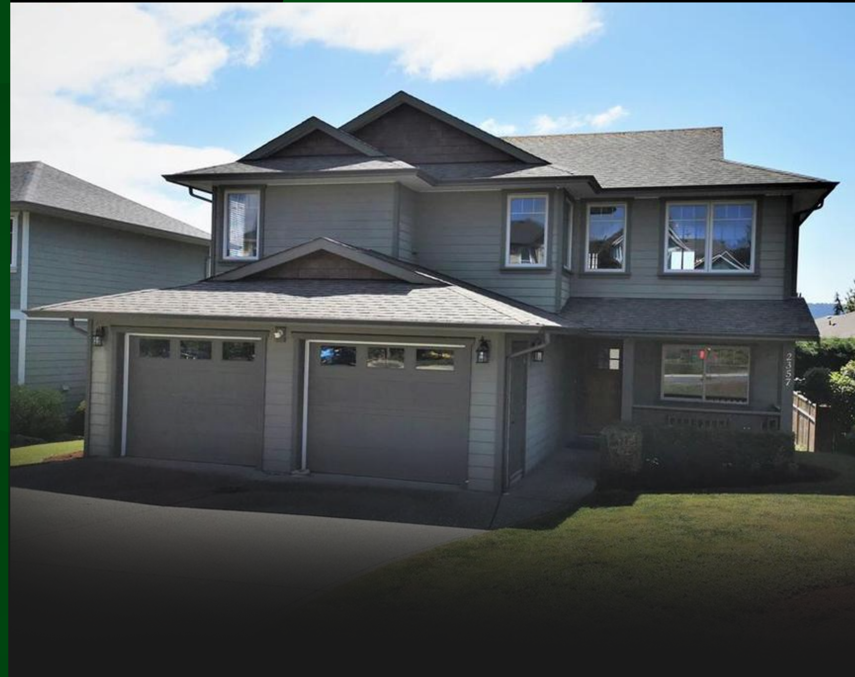
2357 Caffery Place

mikelw@shaw.ca www.mikesellsvictoria.com